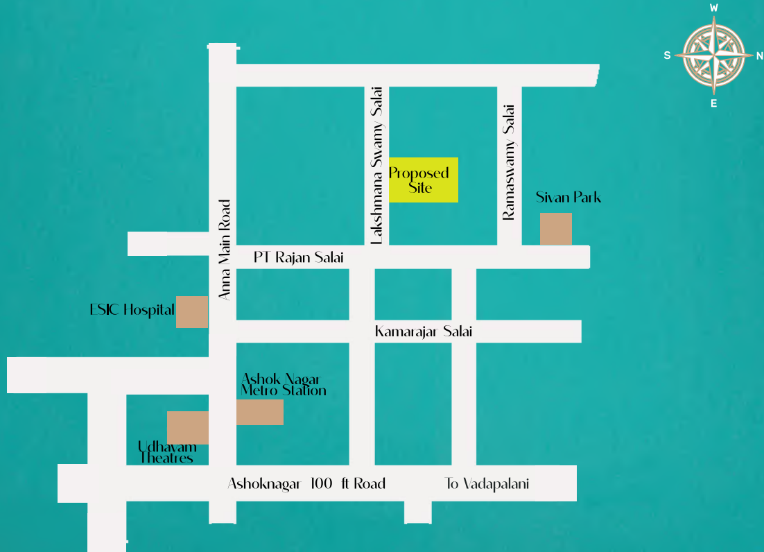
KEY PLAN NOT TO SCALE

This is your chance to own a 3 bhk residential apartments in K K Nagar where luxury comes with affordability.